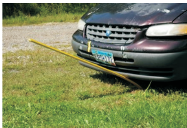
Hybrid 1-Rail Post getting hit