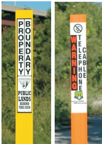
Hybrid 1-Rail Posts